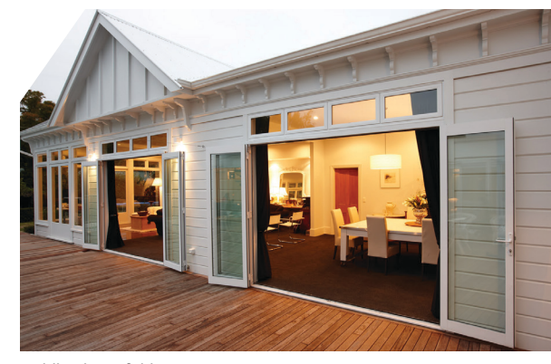
Foldback™ Bifold Door