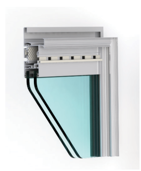
Aluvent™ Passive Ventilation