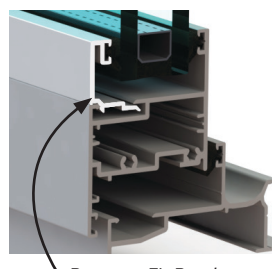
Nessure Fit Bead