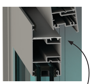
Kleenline™ - Sash Window Frame Platform Cover