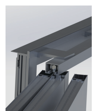
Foldback™ Bifold Door